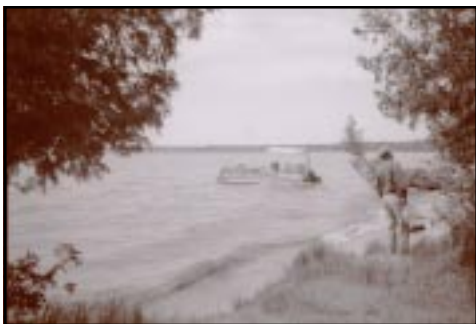
Collecting insects along Higgins Lakeshore