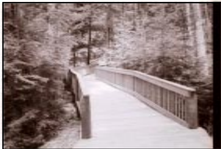
Path and bridge from RAM Conference Center to Higgins Lake