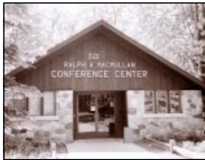
Meeting location - RAM Conference Center Roscommon, MI