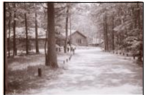
RAM Conference Center